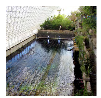
The Ocean at Biosphere 2